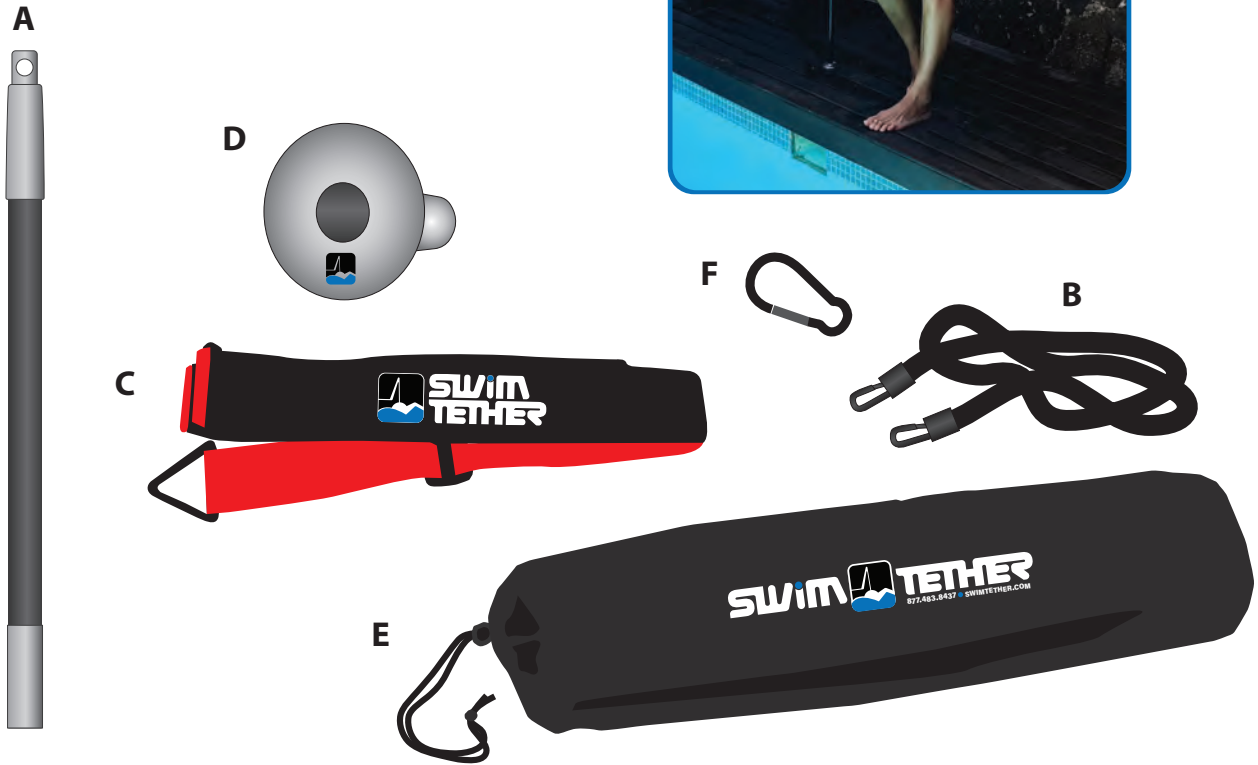
Illustrations not to scale. Actual product may vary and is subject to availability.